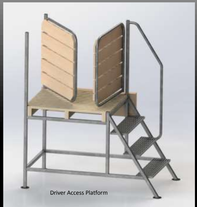
Driver Access Platform