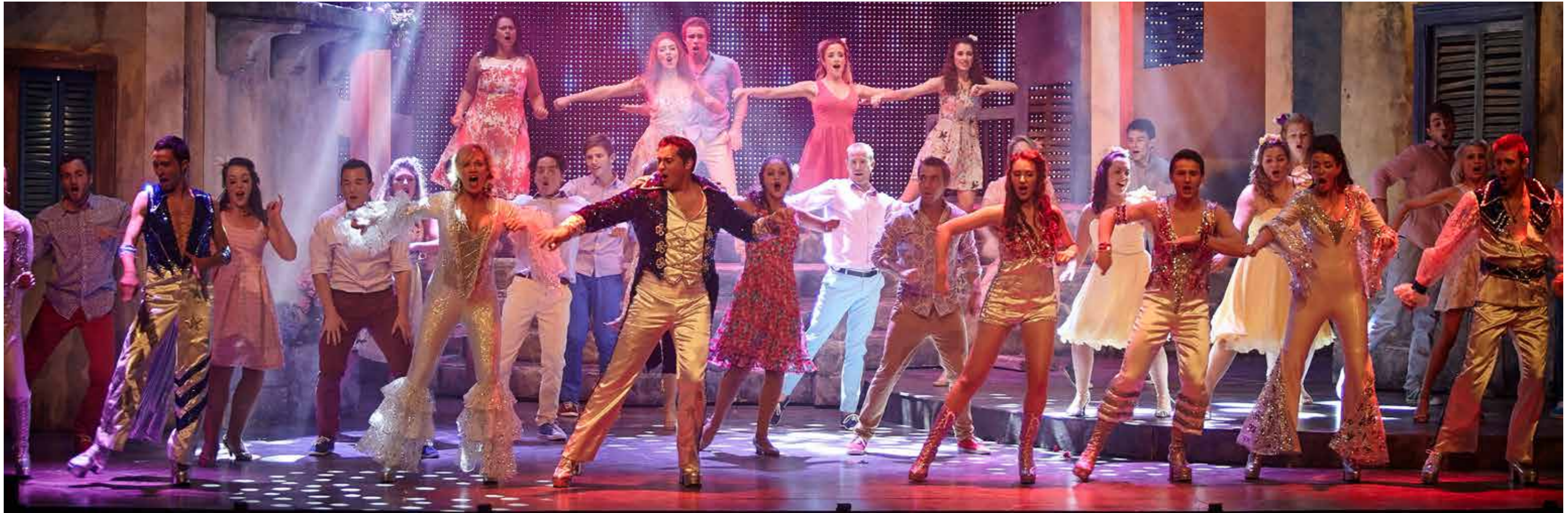
Mama Mia. 2015 Hamilton Operatic Society Inc.