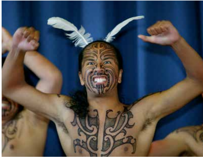
Rotorua Boys High School Kapa Haka group show, 2015.